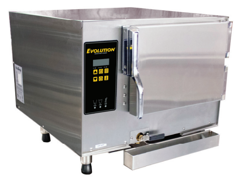
E3 Evolution<sup>™</sup> shown with optional bullet feet

Evolution<sup>™</sup> steamer is AccuTemp Products' connected, boilerless steam cooker that utilizes AccuTemp's patented Steam Vector Technology for faster cook times, improved energy efficiency, better pan to pan uniformity, and less water consumption. Steam Vector Technology requires no moving parts inside the cooking chamber. Steam to be produced inside the cooking cavity with no heating element exposed to water. Easily connects to water and drain line. Uses less than 1.5 gallons of water per hour. Unit to include low water, high water, overtemp warning lights and auto shut off feature. Evolution<sup>™</sup> to include heavy duty, field reversible door. Standard digital controls with independent timer. No water quality exclusions to warranty and no water filtration or treatment required. Unit to be UL Safety and Sanitation Certified, and Energy Star qualified. Built in USA.