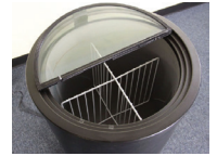
4 section divider top view