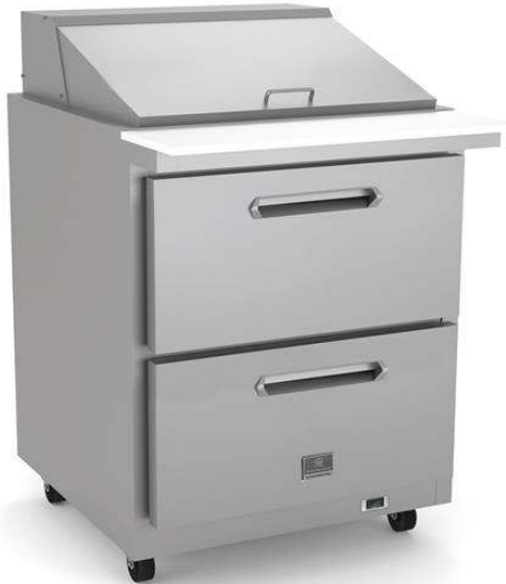
738286 (KCHMT29.12.2D) 2-Drawer Mega Top Prep Table 29" Long 9-1/6 3-1/9 Pan