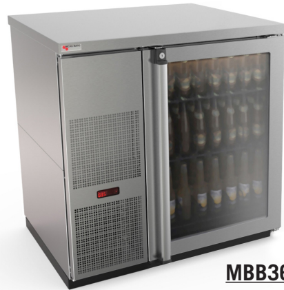
MBB36GS-E Stainless Steel with Glass Door