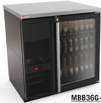
MBB36G-E Black with Glass Door