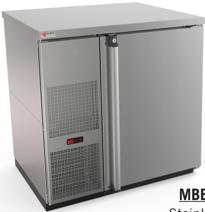
MBB36S-E Stainless Steel