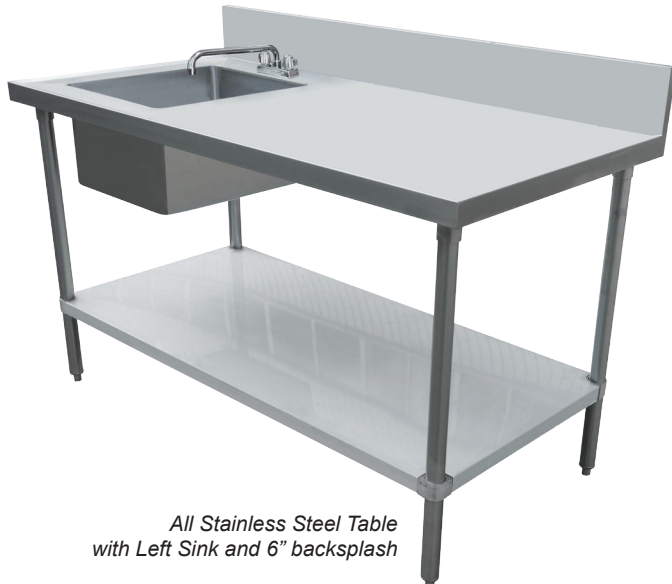
All Stainless Steel Table with Left Sink and 6" backsplash