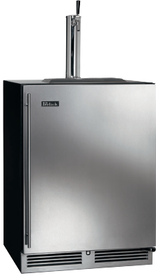
Beverage Dispenser (HC24RS4-T1) Shown with 1 faucet draft arm tapping option