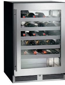
Wine Reserve (HC24WS4)