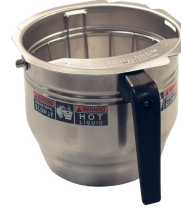
FUNNEL AY,W/DECAL GRT "C"7.12