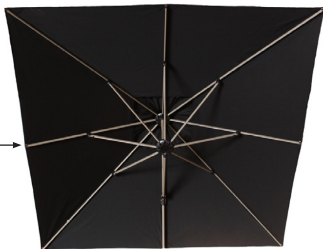
RIB & STRETCHER