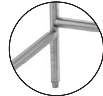
CROSS-BRACING Ensure Stability