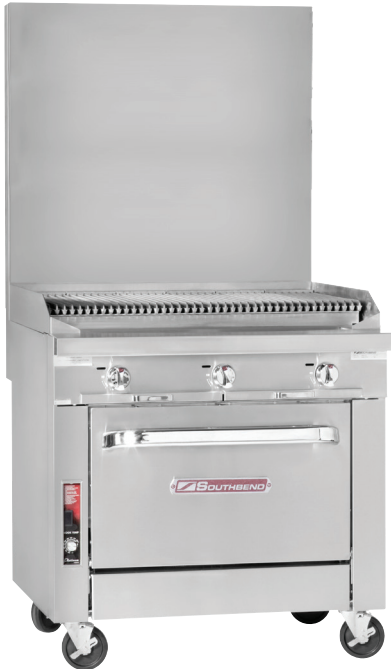
P36D-CCC w/ optional casters and flue riser.