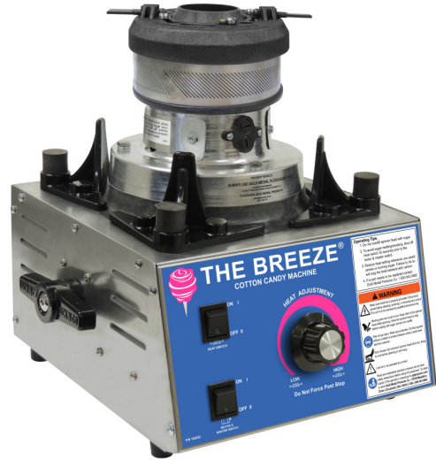
Unit view without Floss Pan