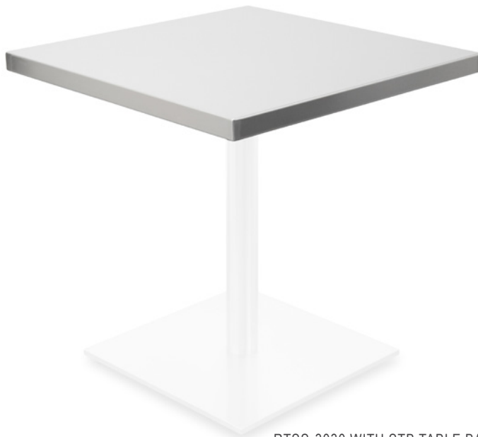
RTSS-3030 WITH STB TABLE BASE (SOLD SEPARATELY)