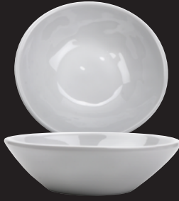
B-5-AM-W Round Monkey Dish 5 oz. 4.25" dia. 1.5" deep 6 dz.