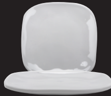
SCS-6-AM-W Square Plate 6" 2 dz.