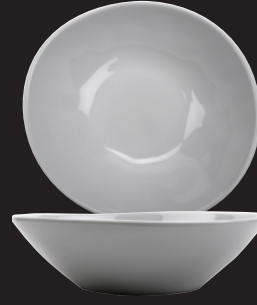
B-18-AM-W Round Bowl 16 oz. 7" dia. 1.75" deep 1 dz.