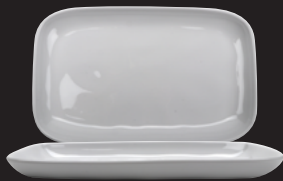
CS-117-AM-W Rectangular Platter 12" x 7.5" 1 dz.