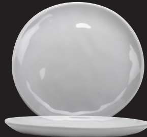
CS-9-AM-W Round Plate 9" dia. 1 dz.