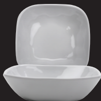
SB-14-AM-W Square Bowl 14 oz. 6" length 1.5" deep 2 dz.