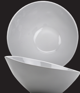
B-792-AM-W Cascading Bowl 24 oz. 9.2" dia. 2.75" deep (front) 4.75" (back) 1 dz.