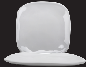
SCS-9-AM-W Square Plate 9.5" 1 dz.