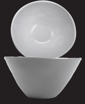
B-22-AM-W Round Bowl 22 oz. 6.25" dia. 2.75" deep 1 dz.