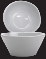
B-3-AM-W Round Ramekin 3 oz. 3.25" dia. 1.6" deep 1 dz.