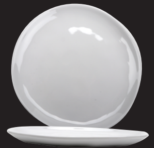
CS-10-AM-W Round Plate 10.5" dia. 1 dz.