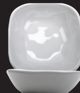
SB-5-AM-W Square Monkey Dish 5 oz. 4.25" length 1" deep 4 dz.