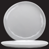
CS-5-AM-W Round Plate 5.5" dia. 4 dz.