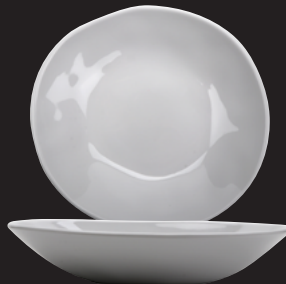
B-42-AM-W Round Bowl 1.3 qt. 10" dia. 1.75" deep 1 dz.