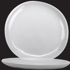
CS-7-AM-W Round Plate 7" dia. 1 dz.