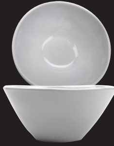
B-8-AM-W Round Bowl 8 oz. 5" dia. 2" deep 2 dz.