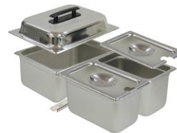
Item No. 8080-01