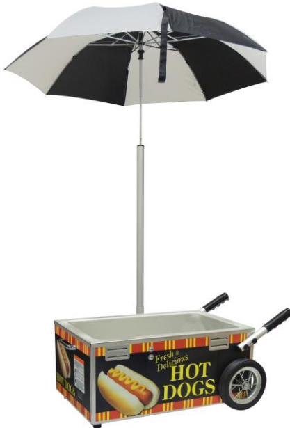
Model 8080-00-110 - Base Tabletop Cart only (Pan and Lid Kit not included)