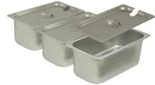
Item No. 8080-02