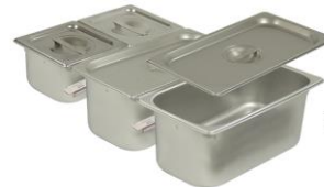
Item No. 8080-05