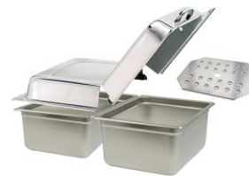
Item No. 8080-03