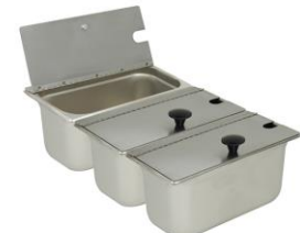
Item No. 8080-04