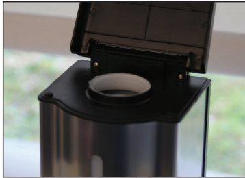
Easy Fill Soap Reservoir