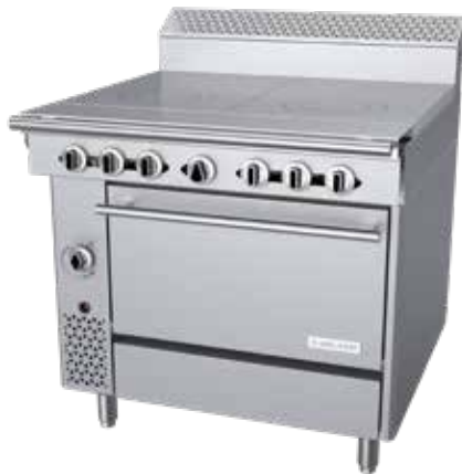
Model C36-10R Range with Two 18" Front-Fired Hot Tops