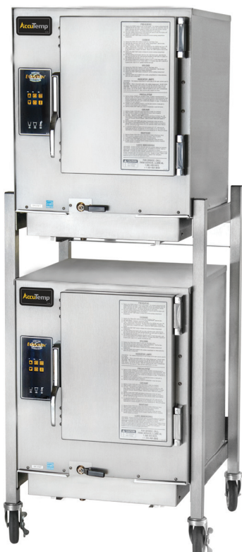
N6 Evolution™ double stacked connected unit mounted on a stainless steel stand with casters

Evolution<sup>™</sup> steamer is AccuTemp Products' connected, boiler-free steam cooker that utilizes AccuTemp's Patented Steam Vector Technology for faster cook times, improved energy efficiency, better pan to pan uniformity, and less water consumption. Steam Vector Technology requires no moving parts inside the cooking chamber. Steam to be produced inside the cooking cavity with no heating components exposed to water. Unit to be powered by a Heavy Duty Stainless Steel Blue Flame Power burner, Easily connects to water, drain & gas lines. Uses less than 1 gallon of water per hour. Unit to include low water, high water, overtemp warning lights and auto shut off feature. Evolution<sup>™</sup> to include heavy duty, field reversible door. Standard digital controls with independent timer. No water quality exclusions to warranty and no water filtration or treatment required. Units to be mounted on a stainless steel support stand. Unit to be UL Safety and Sanitation Certified, and Energy Star qualified. Built in USA.