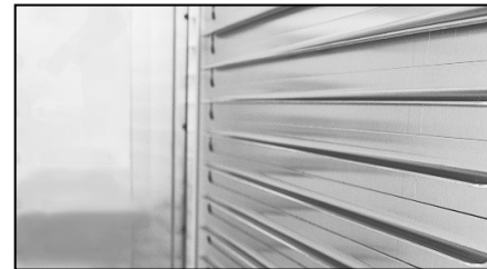
Extruded Channel Type Ledges