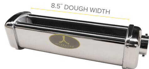
OPTIONAL CUTTER MOLD