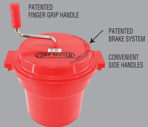
Item No: 90012