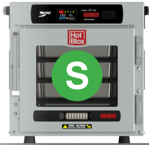
Narrow 4-Pan (N4) Holds 12x20 / GN, and 13 x 18 pans