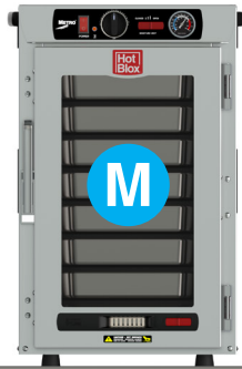
Narrow 8-Pan (N8) Holds 12x20 / GN, and 13 x 18 pans