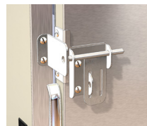
Travel Latch / Hasp (Right hinged door) Model # HBC-TRVL Travel Latch / Hasp (Left hinged door) Model # HBC-LTRVL (Not available on N4 models)