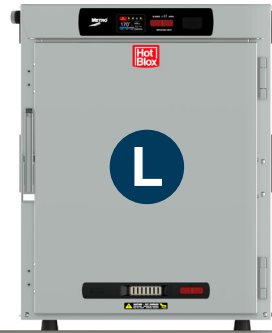
Wide 8-Pan (W8) Holds 18 x 26 pans, 12x20 / GN, and 13 x 18 pans