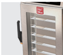
Offset Door Latch Model # HBC-OFFLATCH