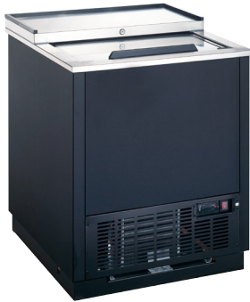
Item 50073 150L Capacity