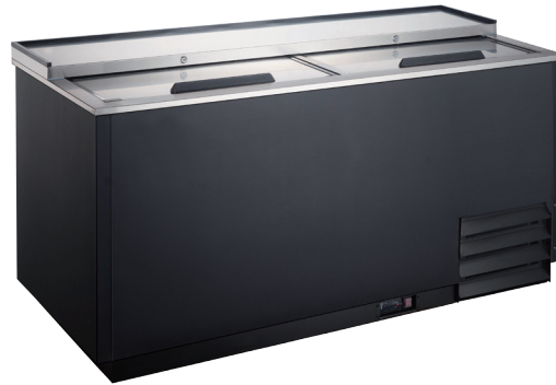
Item 50074 400L Capacity