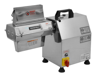
MG1-MTA74 S/S MEAT TENDERIZER MG-12EHD-B + MTA74