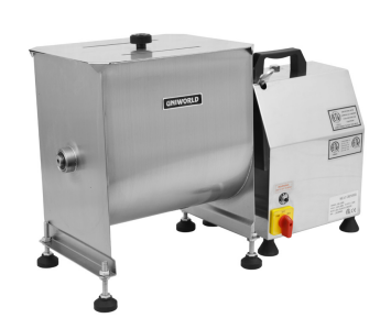
MG1-MMX02 STAINLESS STEEL MEAT MIXER MG-12EHD-B + MMX02