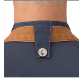
back collar apron holder