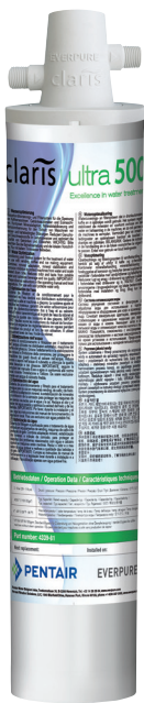
Head sold separately.

Claris Ultra 500-M Filter Cartridge: EV4339-81