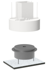
Model SSA-ISLE72R shown