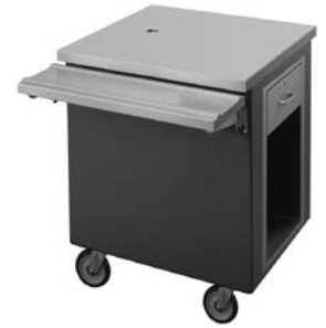
Model RANFG CA shown with RAN INV30 trayslide