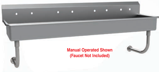
Manual Operated Shown (Faucet Not Included)