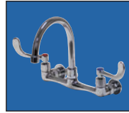
"F" Series Sink Includes K-161-LU Gooseneck Faucets with Wrist Handles