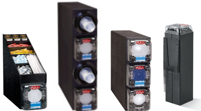
Countertop LidSaver™ and Condiment Organizer