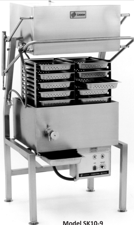
Model SK10-9 (with optional food pans)