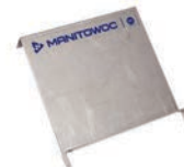
K00482 - Hanger (required with K00461)