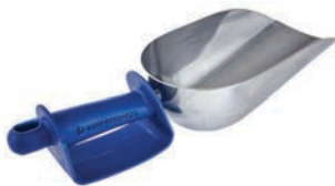
K00463 - NSF Metal Scoop