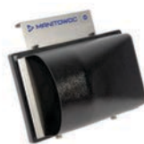
K00461 - NSF External Scoop Holder