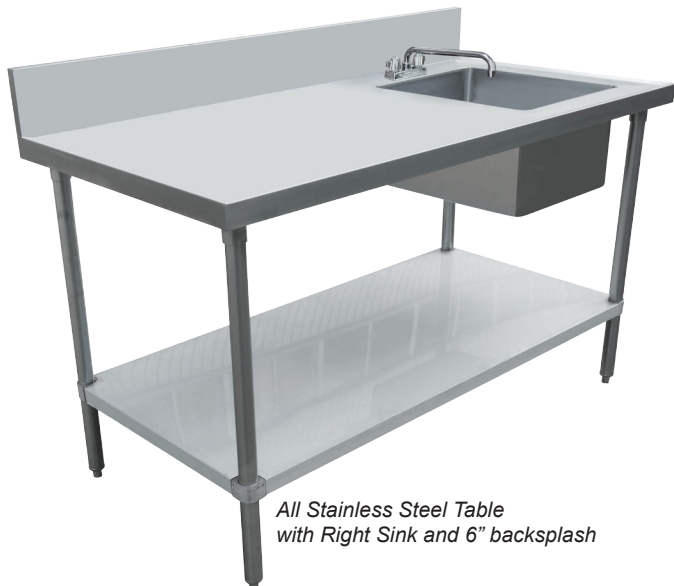
All Stainless Steel Table with Right Sink and 6" backsplash