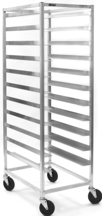
model #OUR-1211-5 combination rack

Eagle Panco® Combination Rack, model _____. Constructed of 1" square tubular aluminum frame and supports, with each frame and cross support junction joined with a two-piece aluminum gusset riveted to the frame. 1½" x 3⅞" tray slides with beaded edge riveted to the frame. Slide spacing is 3" or 5" to accommodate a variety of sized trays and pans. Furnished with 5"-diameter casters. Unit shipped assembled.