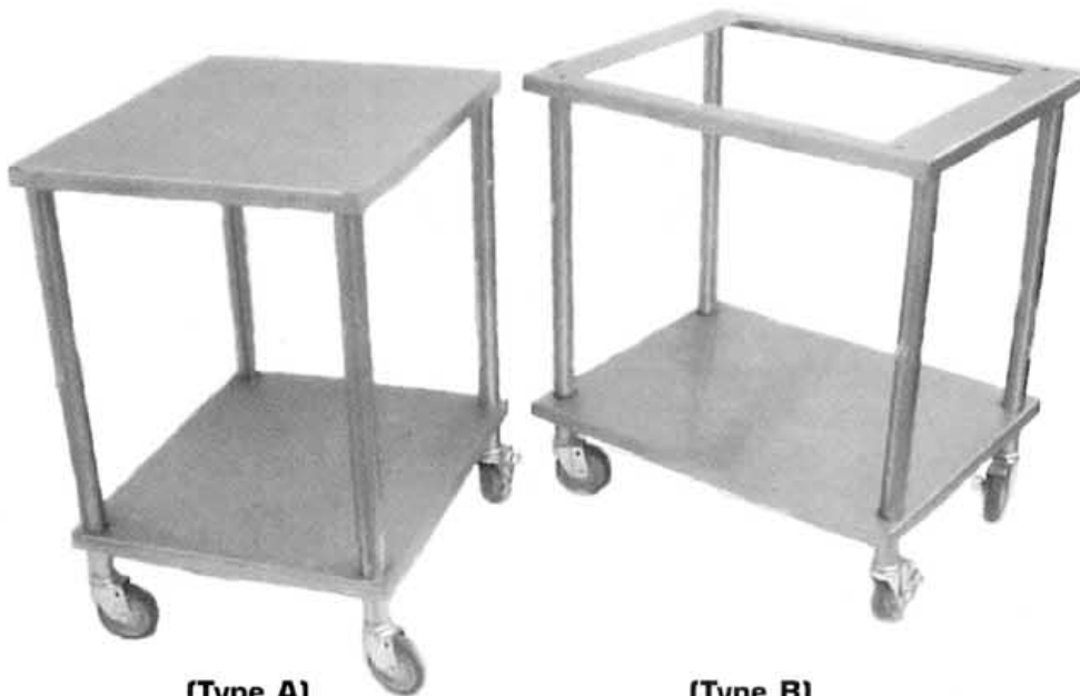
(Type A) SUT-0020 SUT-0070

A rugged heavy duty mobile equipment table. Ideal for Somerset dough rollers, sheeters and bread molders. Designed to be versatile for any food service kitchen requiring mobile tables for mixers, slicers and other equipment. Tops and shelves are heavy 12 gauge stainless steel. 1 1/2" OD stainless steel legs are fitted with 4" heavy duty swivel casters with 2 brakes.