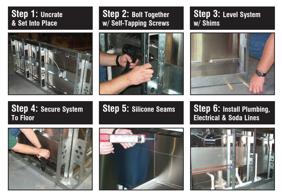
Assembled And Divided Into Sections For Shipment • Arrive To Job Site Ready For Installation