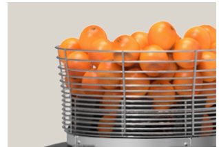
Basket in two sizes

The machine includes a 20 lbs capacity basket with lid as standard, which prevents access to the oranges.