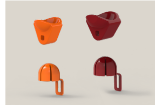
Juice extraction kits

A system developed by Zummo to assemble and disassemble the balls of the kit in just one movement.