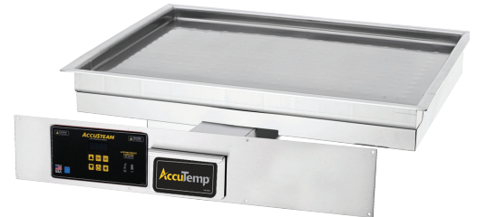
EGD-B36 AccuSteam™ Drop-In Griddle