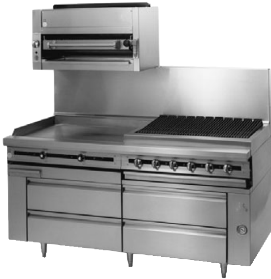
JRLH-04R-T-72 shown with JSB-36RM, JMRH-36GT, JMRH-36B