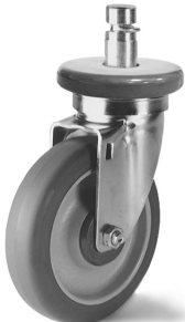
(nickel-plated) caster with polyurethane tread