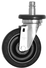
swivel caster with resilient tread

* See charts for complete model numbers.