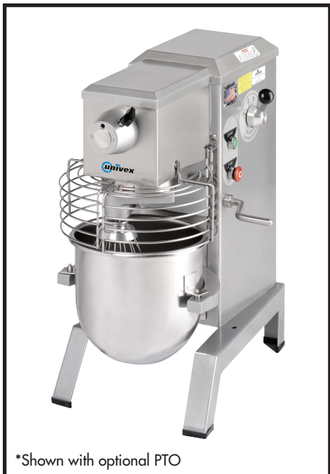
*Shown with optional PTO