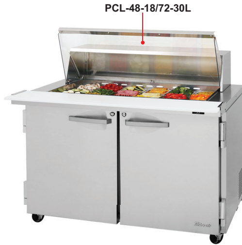
PST-48-18-N with PCL