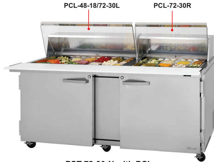
PST-72-30-N with PCL