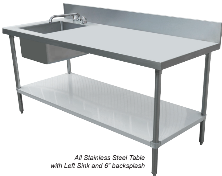
All Stainless Steel Table with Left Sink and 6" backsplash