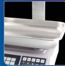
Optional Fish Pan