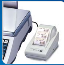
Optional Label Printer