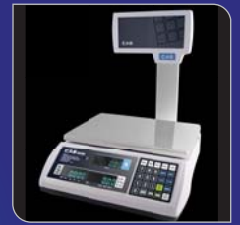
VFD Pole Model