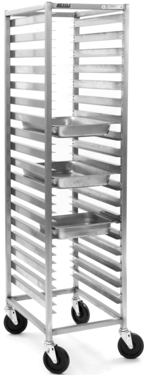
single-width stainless steel rack

Eagle Panco Stainless Steel (Single Width or Double Width) Racks, model _____. Stainless steel construction with 1" square tubular frame and supports all-welded. 16/304 stainless steel tray slides 1½" x 1" riveted to vertical uprights. 3" slide spacing to accommodate a variety of pans or trays. Furnished with 5"-diameter casters. Unit shipped assembled.