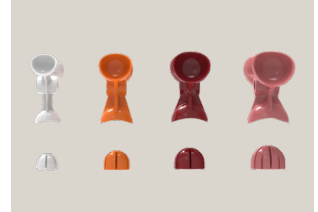
Juice extraction kits

Medium (M): Orange; Large (L): Yellow; Optional- Extra large(XL): Pink; Small (S): Grey.