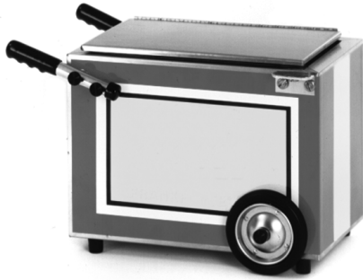
#HD612FW-SH sterno unit

Eagle Countertop Hot Dog Sterno Unit, model _____. Heavy gauge stainless steel construction. Removable inset for easy cleaning. Holds two 8-oz. fuel cans (not included).