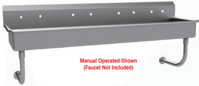
Manual Operated Shown (Faucet Not Included)