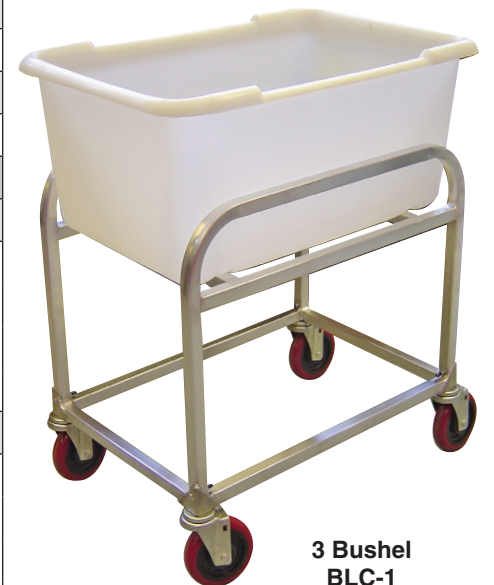
3 Bushel BLC-1