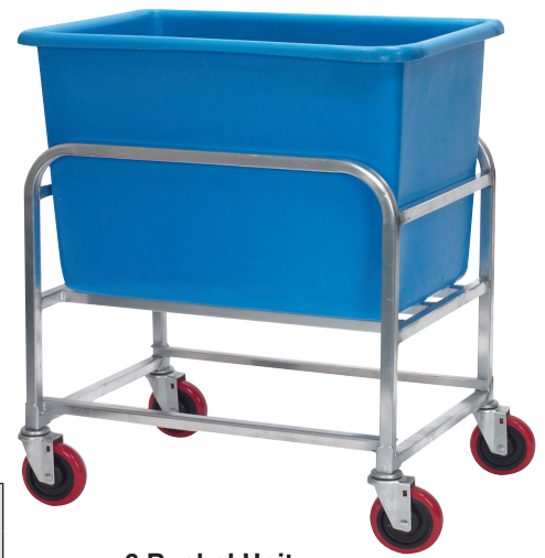
6 Bushel Unit 30-6-A/BL