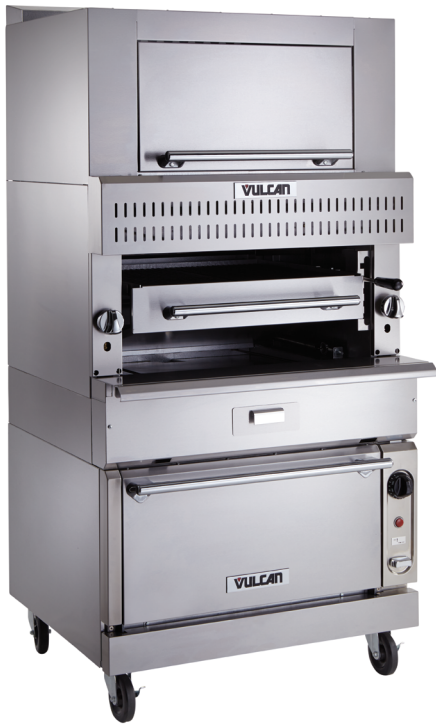
Model VBB1SF (shown on a standard oven base and optional casters)

Ceramic Radiant Upright Broilers 36" Wide Gas Range