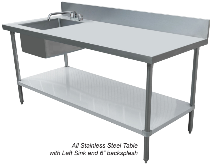
All Stainless Steel Table with Left Sink and 6" backsplash